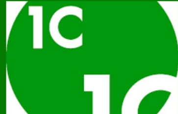
IC-10 PROYECTOS TÉCNICOS Y CONSTRUCCIONES, S.L.