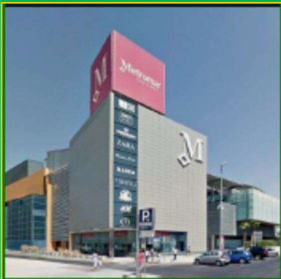
METROMAR, MAIRENA DEL ALJARAFE

As is, to a greater extent if possible, the construction of the Central Market of Huelva and the parking building linked to it.